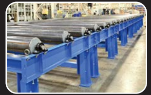
Bar, Beam, Tube & Pipe Mills