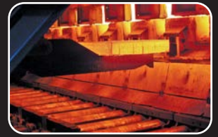
Hot & Cold Mills